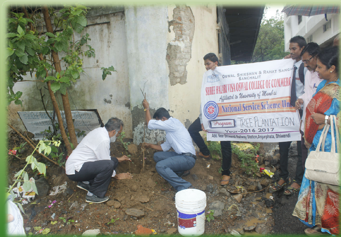
Inauguration of NSS unit With Tree plantation at College